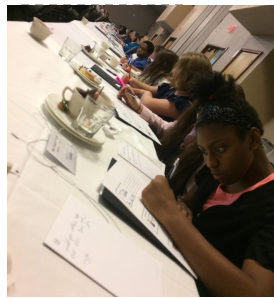
Students taking notes and brainstorming during a session.