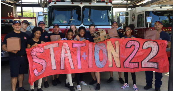
Hospitality students delivering bread baskets to our first responders at fire station #22.

The mission of the Academy of Entrepreneurial Studies is to build the capacity for philanthropy through teamwork, collaboration, problem solving and leadership with service learning focused on the Global Sustainable Development Goals to help students be career and college ready.